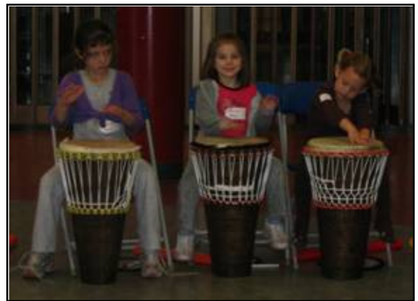
Family Weekend 2007 was a huge success: Kidz Konnection drumming workshop